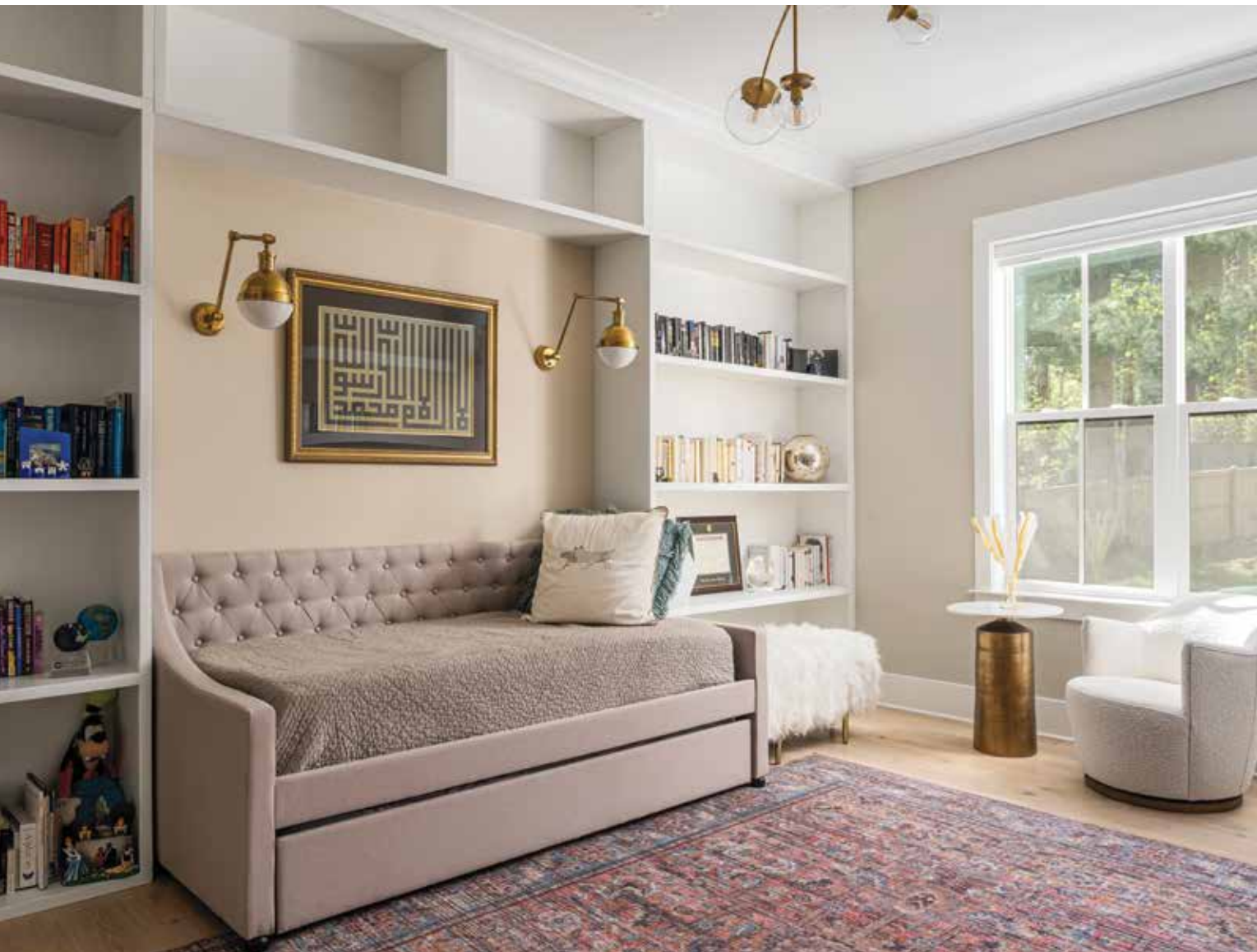
The study was designed with an open space for a daybed and built-in shelving for storage and display. The flat baseboards and window trims are modern-farmhouse elements.

The kitchen's open, airy feel was achieved by combining the open floor plan with lots of opportunity for natural light to shine through it and glass shelves. "The kitchen continues the use of large windows found in the open family room," Scott says. "The use of glass shelving avoids the cluttered feel of cabinetry, keeping the kitchen light, open and luxurious."