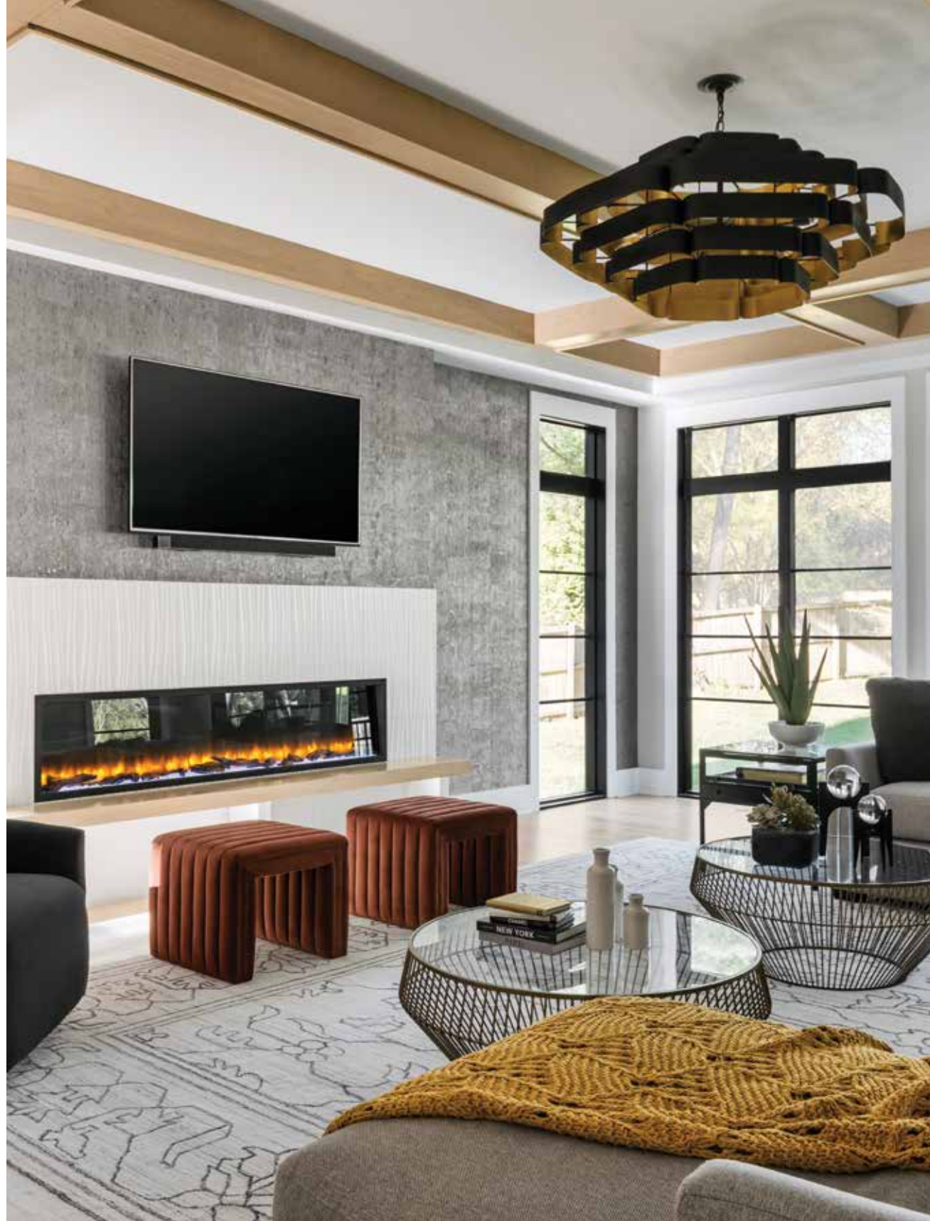
Stained wood beams were used on the ceilings. The interior design accessories blend in with the architecture. The fireplace tile surround and black wood window frames are modern farmhouse elements.

As builders and buyers both know, a home's location is a key factor in determining the design and achieving the appeal of the deal. And this location had a lot going for it. "The homesite is located in Fawsett Farms, a well-established premier community in Potomac," Dinesh says. "In recent years, decades old Colonials are being replaced with a variety of unique custom homes in various architectural styles, including Craftsman, Mediterranean, Modern Farmhouse, Transitional and Contemporary."