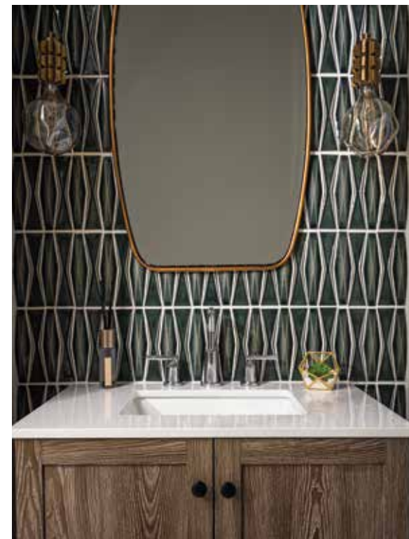
top | The primary bathroom was constructed as an ensuite to the master bedroom. The common element for all three photos on this page is tile accent walls. Having an accent back wall draws the eye through the room. With its white and brass mixed mosaics, the tile behind the bathtub is an elegant touch. The standing tub design is a modern farmhouse element.