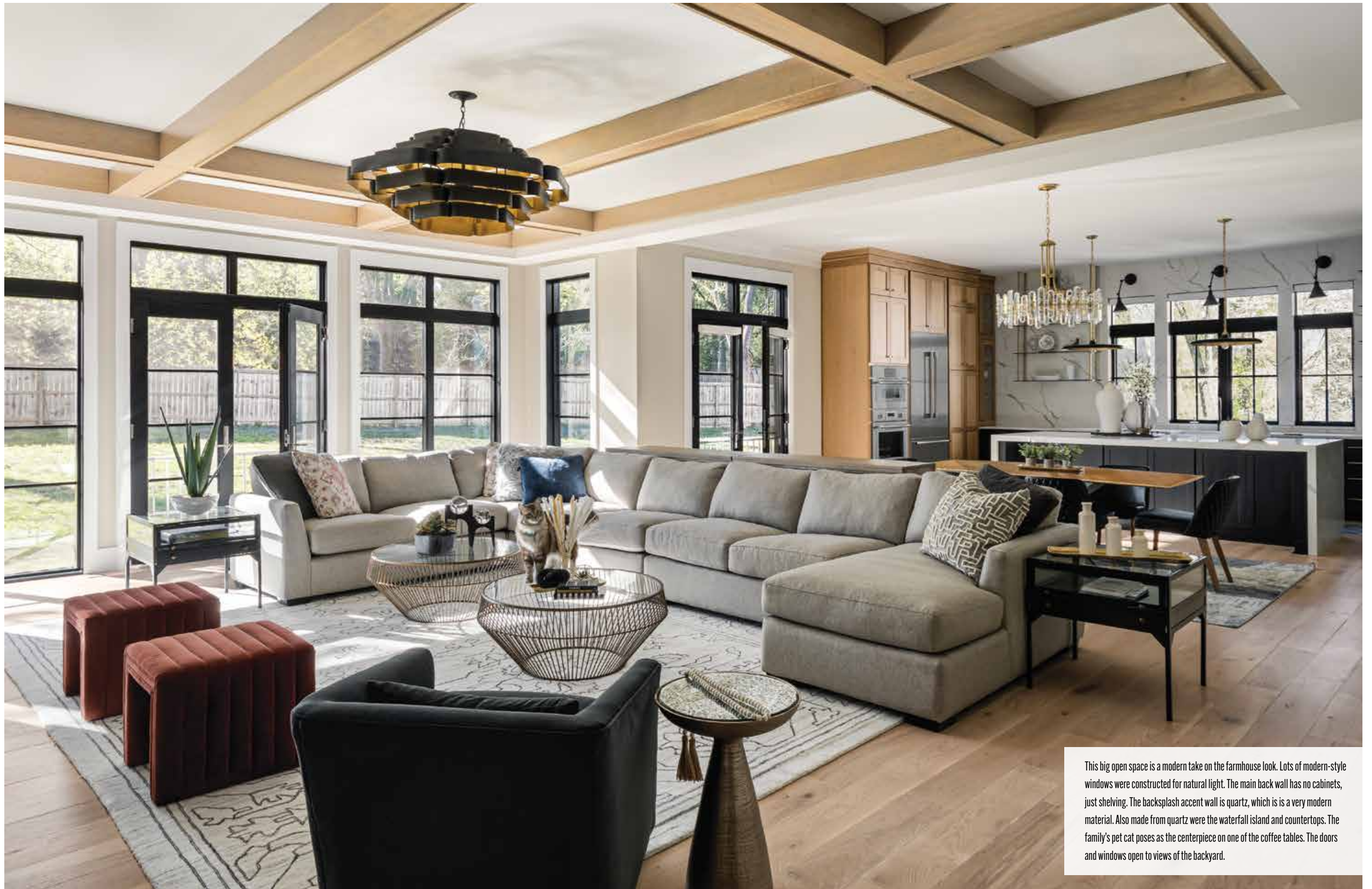
This big open space is a modern take on the farmhouse look. Lots of modern-style windows were constructed for natural light. The main back wall has no cabinets, just shelving. The backsplash accent wall is quartz, which is a very modern material. Also made from quartz were the waterfall island and countertops. The family's pet cat poses as the centerpiece on one of the coffee tables. The doors and windows open to views of the backyard.