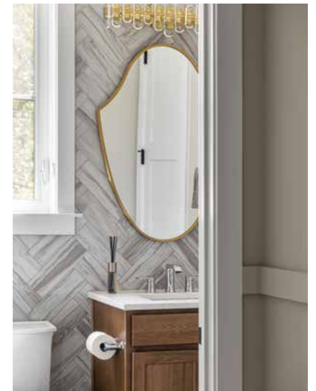
above, left | The ceramic-tile texture in this powder room ties in with the rest of the house for a glazed "color and crackle" effect. above, right | The first-floor full bath features an accent wall in Daltile's Calacutta Sky herringbone pattern 4" x 12" tile.